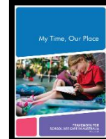
My Time, Our Place; Framework for School Age Care in Australia 2022 V2

Critical reflection: is a meaning-making process that assists informing future practice in ways that demonstrate an understanding of each child’s learning, development and wellbeing and implications for equity and social justice. It involves examining and analysing events, experiences and practices from a range of perspectives to inform future planning and decision-making ( Early Years Learning Framework 2022 V2 – refer to Sources ).