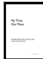
My Time, Our Place; Framework for School Age Care in Australia

Critical reflection: Reflective practices that focus on implications for equity and social justice ( Early Years Learning Framework – refer to Sources ).